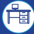
Desks & Chairs