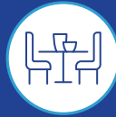
Counters & Tables 1