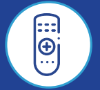
Remote Controls 2