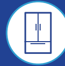
Breakroom Appliance Handles