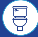
Flush Handles & Toilet Seats