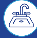
Sinks & Faucets