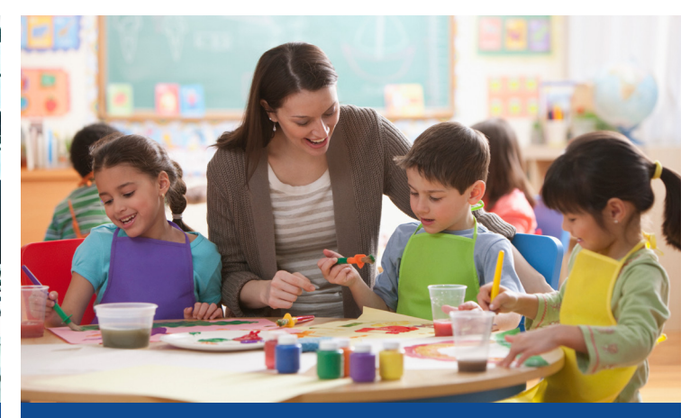
50% of children complete schoolwork faster and are more creative in a clean space.3